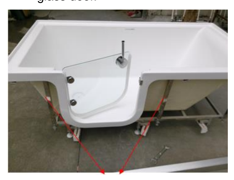
Stainless steel poles

1. Adjust the height of the stainless steel poles to solve the leakage of glass door.